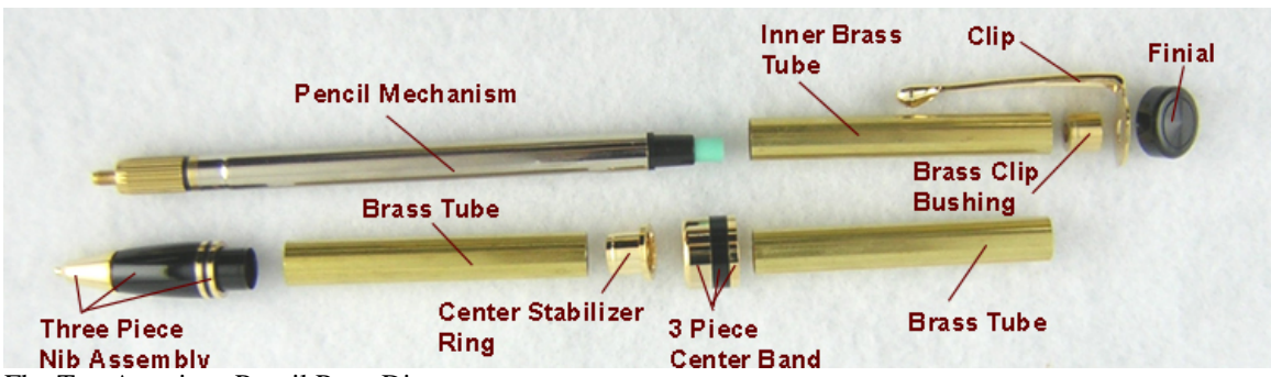
Flat Top American Pencil Parts Diagram

Needed: Mandrel-B Bushings-1B (1B-bushing sizes: cap clip bushing-0.485", cap center band bushing-0.485", barrel center band bushing-0.385", barrel tip bushing-0.385"). Drill-O Wood Size-5/8" x 5/8" Square x 5" Long